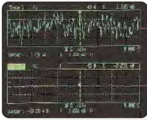
Analog Lock-In Amplifier

Dynamic reserve is defined as the ratio of the largest interfering signal or noise to full scale signal that can accurately (<5%) be measured by a lock-in amplifier. For example, if full scale is 1 \mu\text{V} , then a dynamic reserve of 60 dB means that noise as large as 1 mV (60 dB greater than full scale) won't affect the measurement more than a few percent. Analog lock-ins are limited to about 60 dB dynamic reserve and experience poor stability ( > 500 \text{ ppm}/^\circ\text{C} ) when measuring a small signal in an extremely noisy environment. To achieve more than 60 dB dynamic reserve, they resort to pre-filtering the input signal which degrades accuracy. Using DSP to replace the demodulator, amplifiers and output filters found in analog lock-ins, the SR810 and SR830 are able to provide greater than 100 dB dynamic reserve ( < 5 \text{ ppm}/^\circ\text{C} ) without pre-filtering, and measurements are free of the artifacts and limitations found in conventional lock-ins.