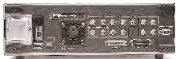
SR810 & SR830 Rear Panel